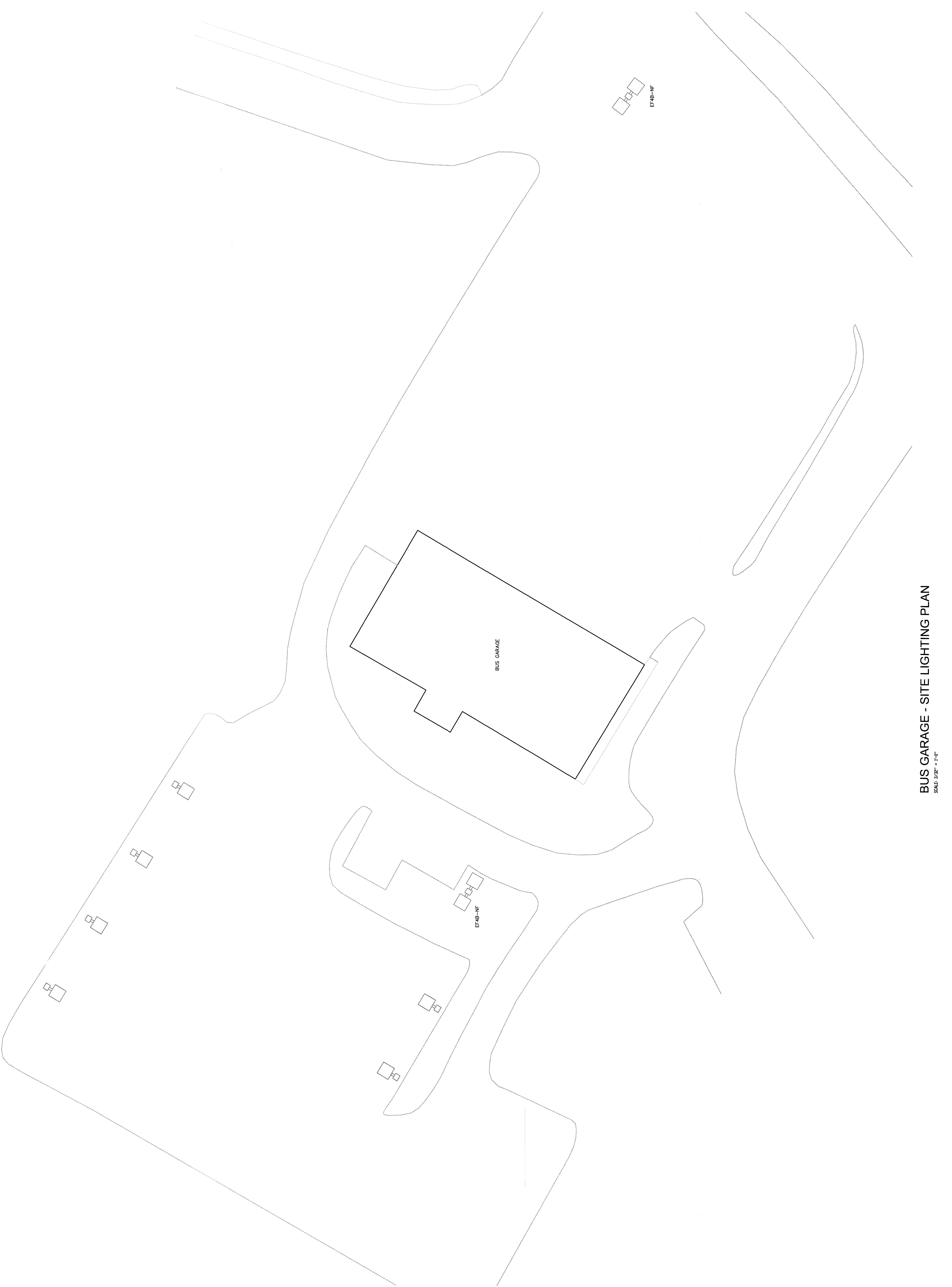
BUS GARAGE - SITE LIGHTING PLAN SCALE 3/32" = 1'-0"